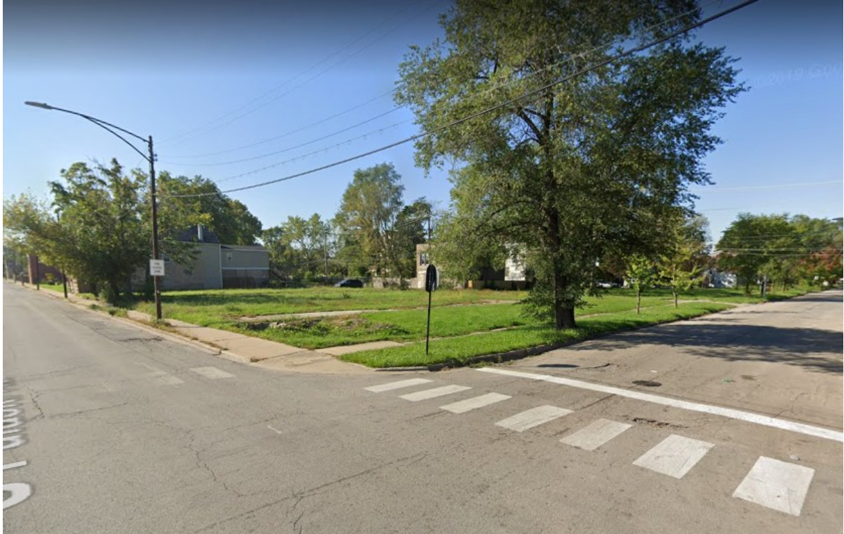
Street view of the project site of the five adjacent lots. Facing southwest.