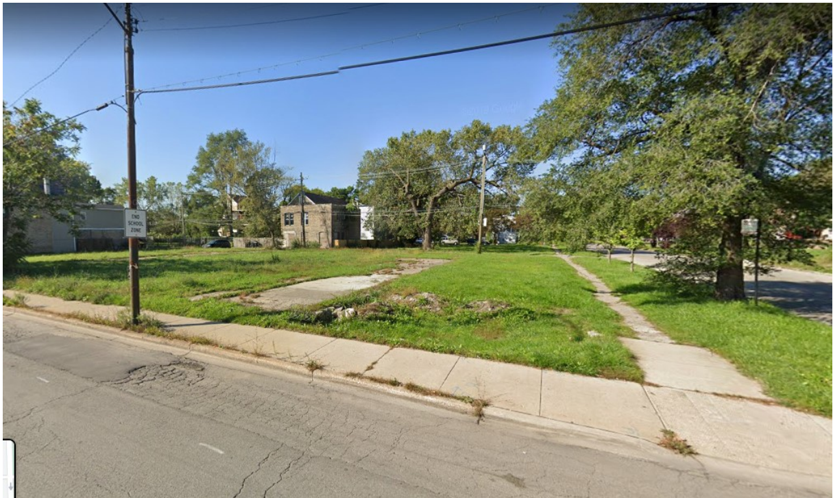
Street view of the project site of the five adjacent lots. Facing west.