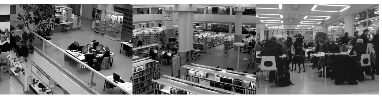
Jyväskylä City Library - Regional Library of Central Finland (left) and the Jyväskylä University Library (right) engage in well-functioning collaboration