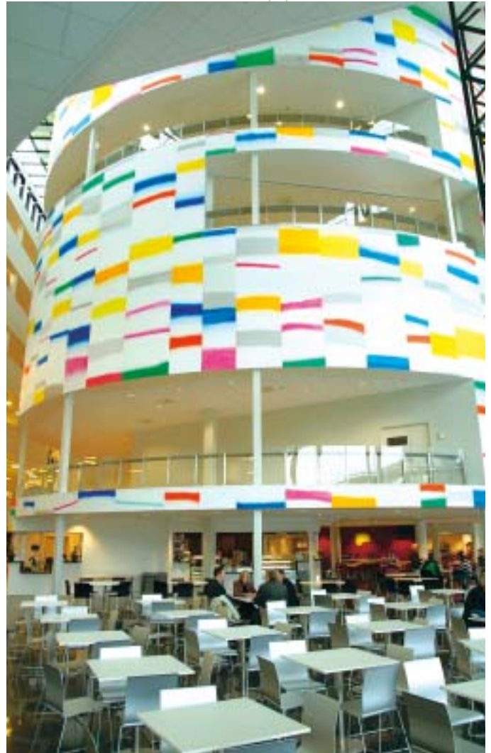
Lots of open space at Drammen Library, Norway