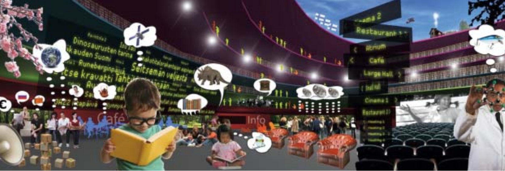
A vision from the work group report on the new Helsinki library. The Heart of the Metropolis – the Heart of Helsinki . Review Report 2008

celebration of Finland's independence. In order for the project to be finished by that time, the project plan must be ready by the beginning of 2010 and project decisions must be made during 2010. This way, the architecture competition for the project could be arranged in 2011.