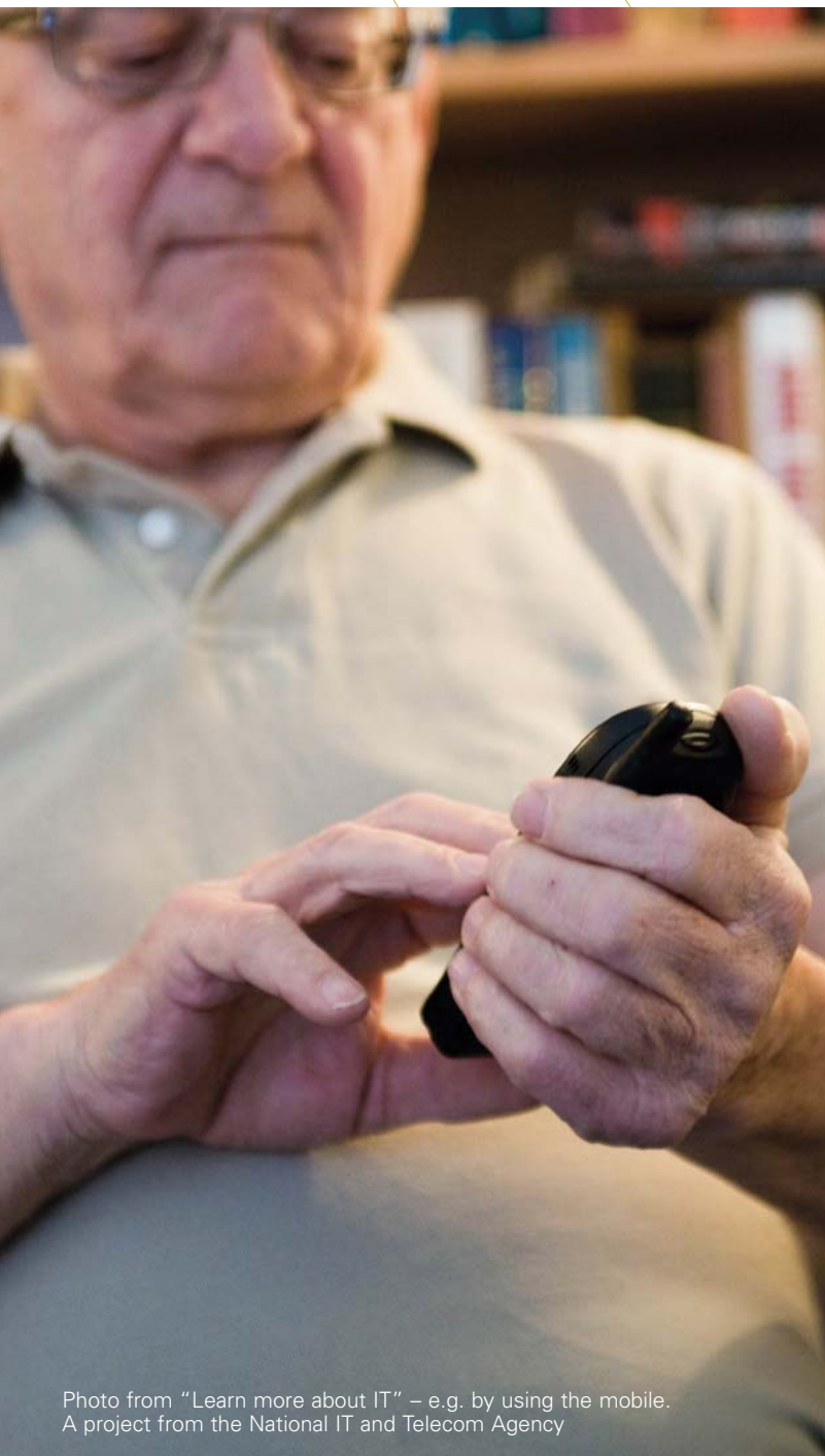
Photo from "Learn more about IT" – e.g. by using the mobile. A project from the National IT and Telecom Agency

The same service was launched earlier this year at the Celia Library in Finland. The project is called 'Audio Stream'. Celia Library was founded in 1890 in Helsinki and is a state-owned special library. It produces and lends audio books, Braille books, e-books and other special materials.