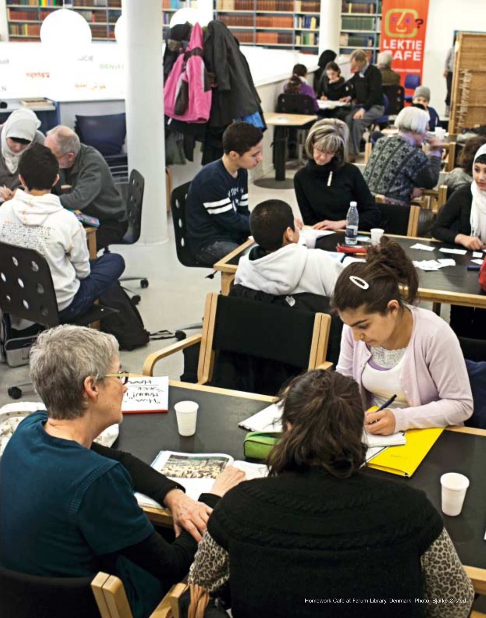
Homework Café at Farum Library, Denmark.