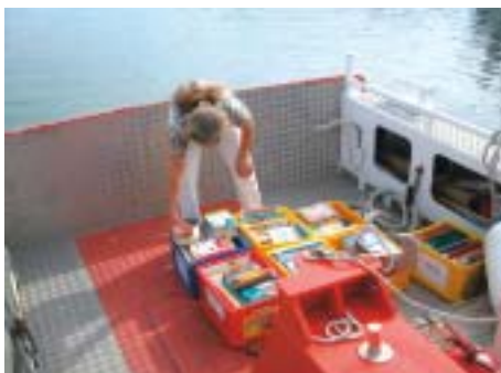
Boat library in Finland.