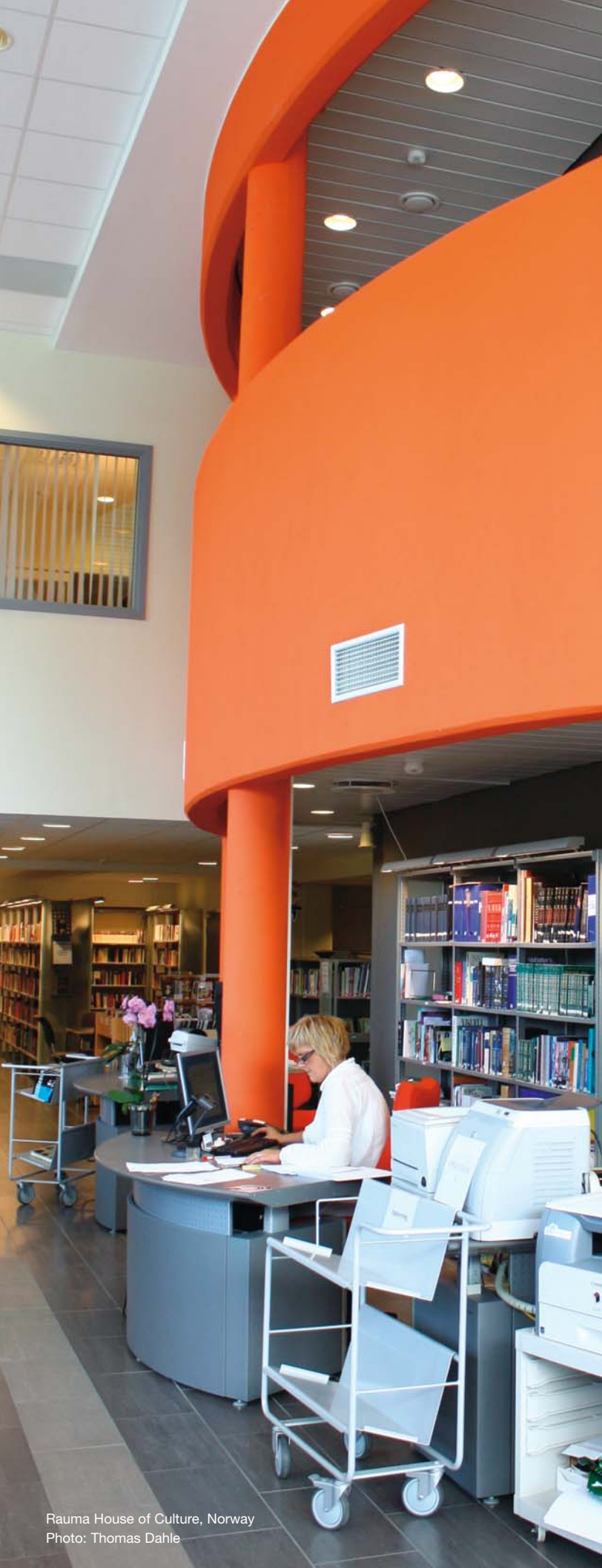
Rauma House of Culture, Norway