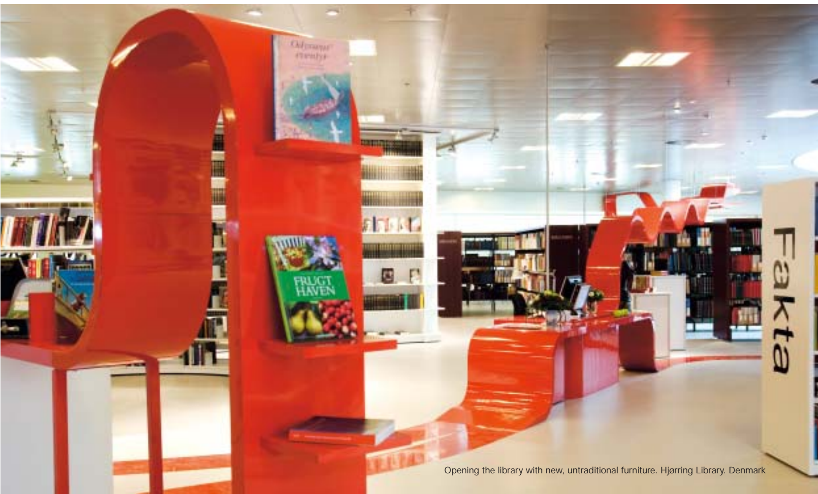
Opening the library with new, untraditional furniture. Hjørring Library. Denmark

This is a slightly revised version of an article published in SPLQ no. 4, 2008