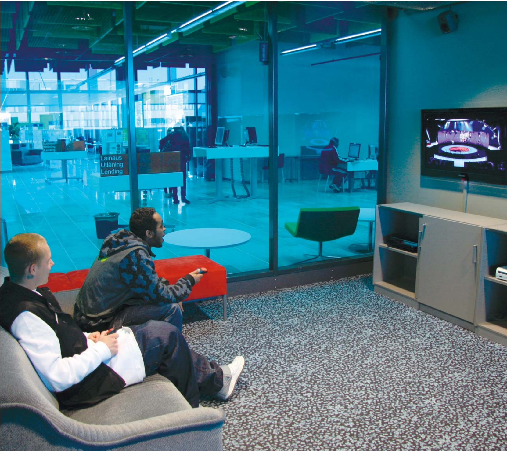
Multimediaroom, Entresse Library, Finland.