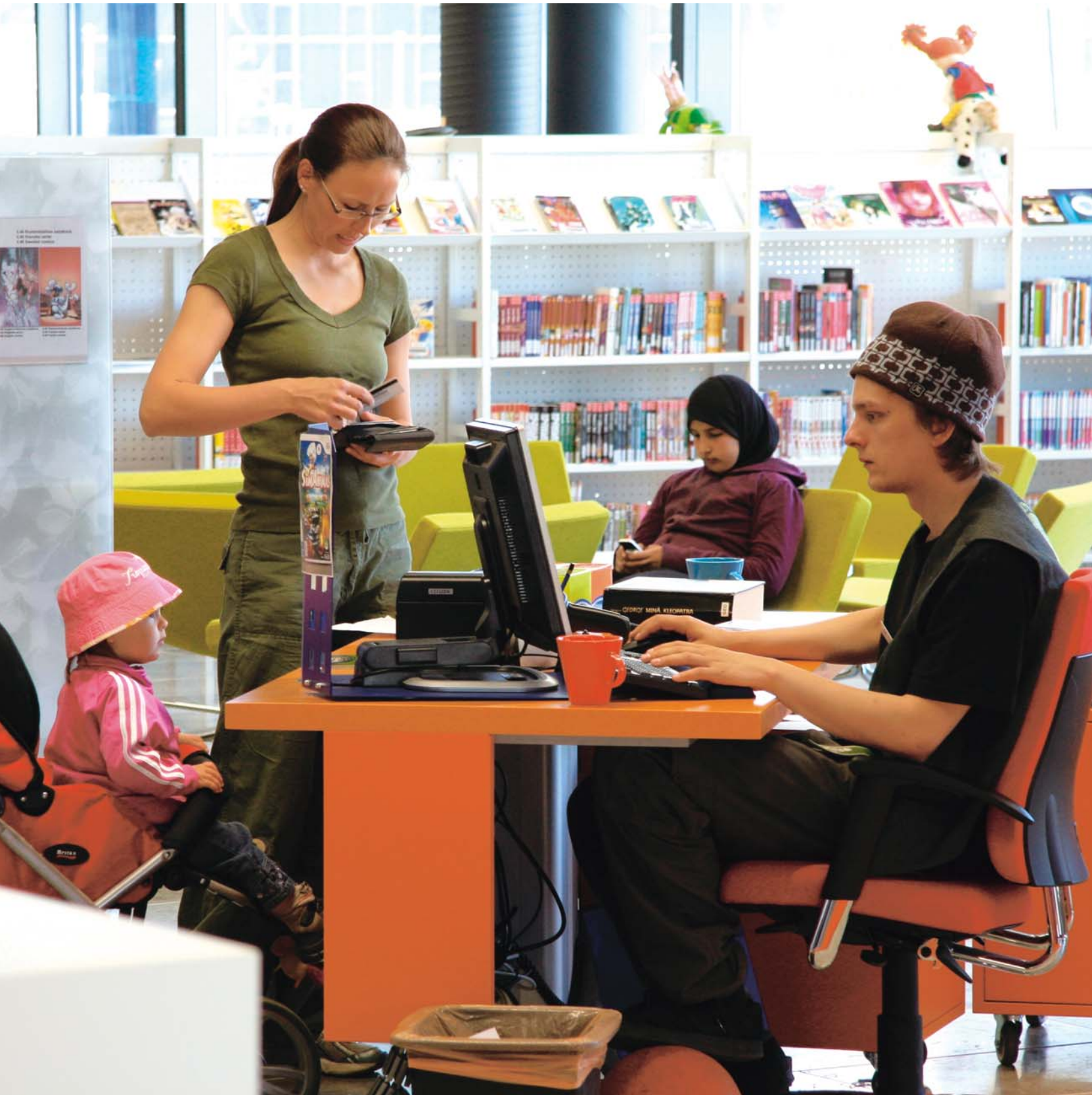
Entresse Library, Finland.