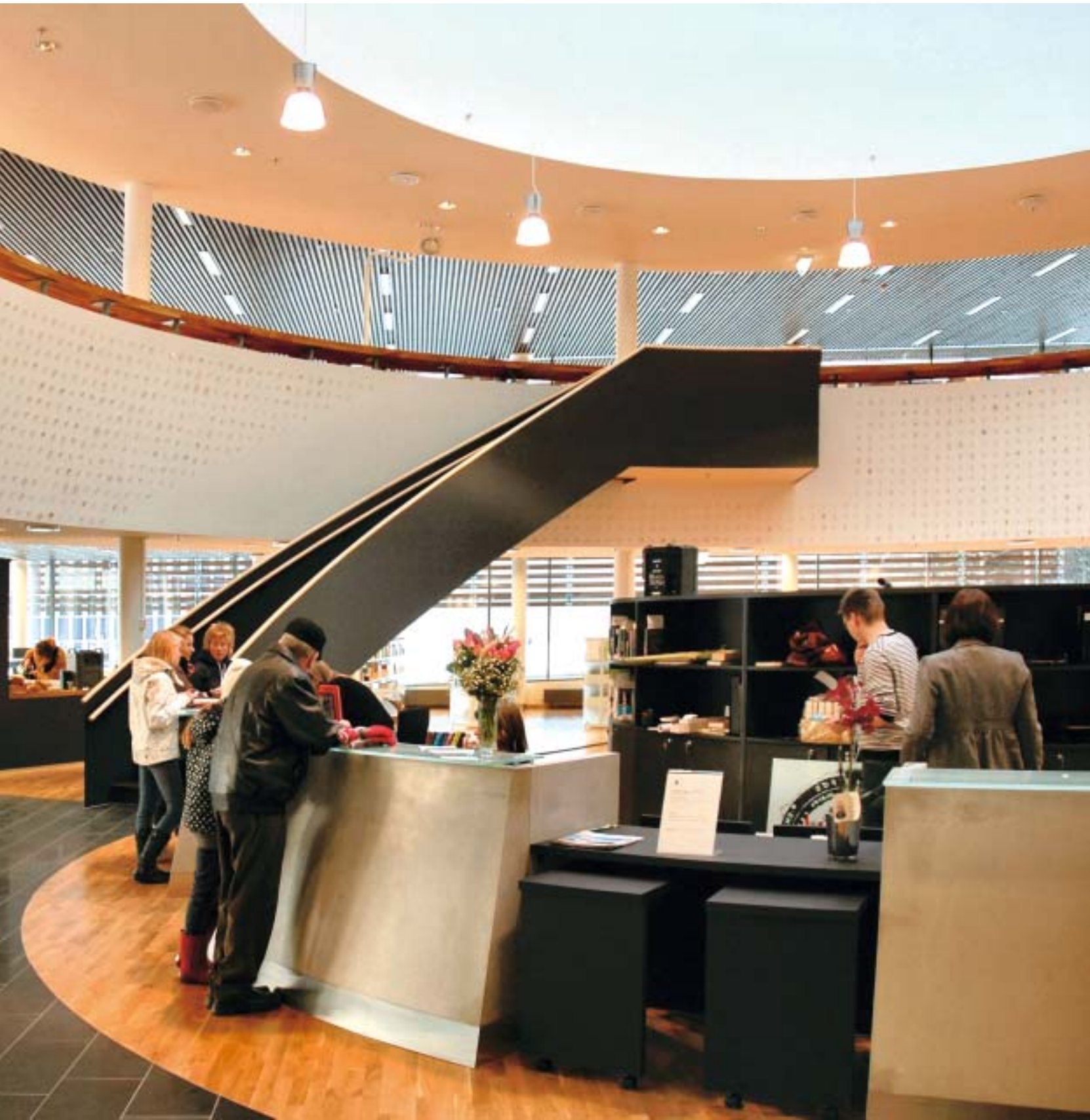
Information Centre at Kongsvinger Library, Norway