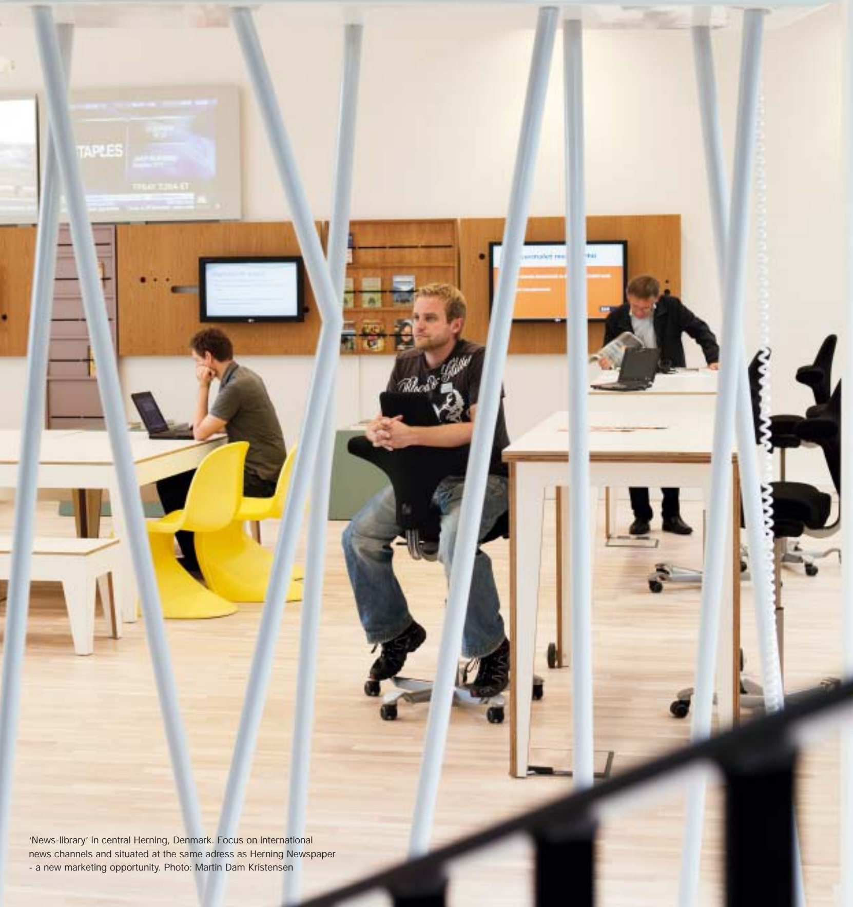
'News-library' in central Herning, Denmark. Focus on international news channels and situated at the same address as Herning Newspaper - a new marketing opportunity.