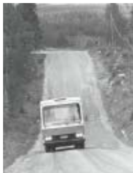
Mobile library on the road in North Karelia in the 1980s