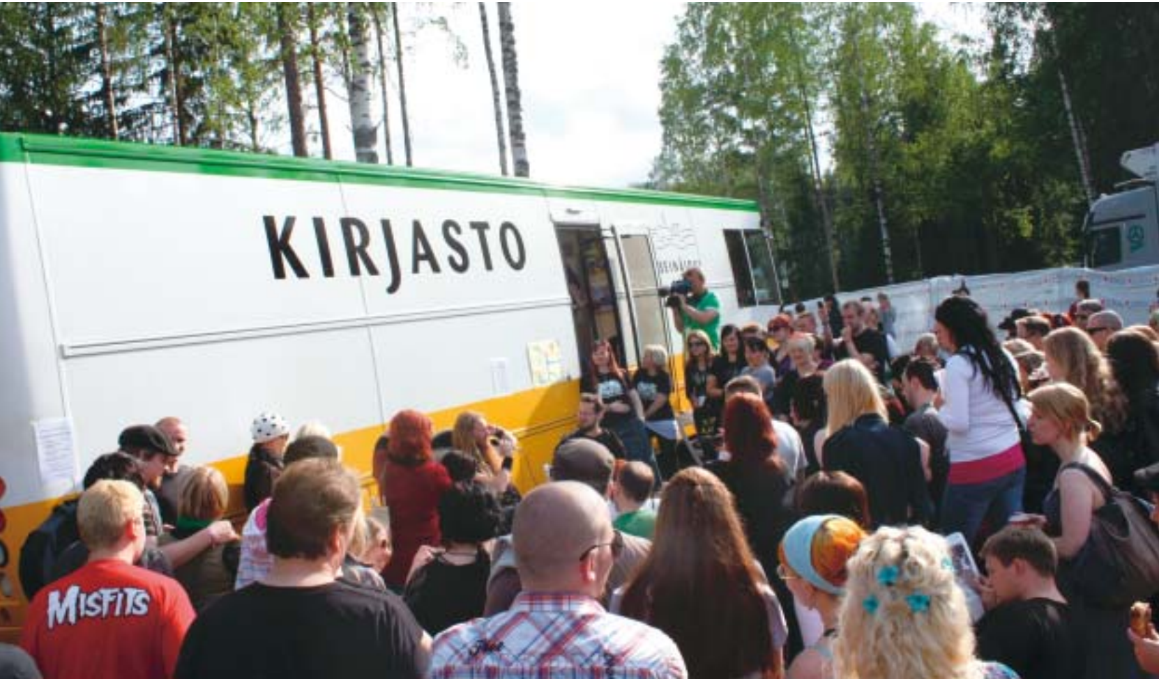
Mobile library today: 'The libraries moveswith the people' has a special meaning in Finland, where numerous mobile libraries form a network of services throughout the country. Seinäjoki bookmobile at Provinssirock, summer 2009.