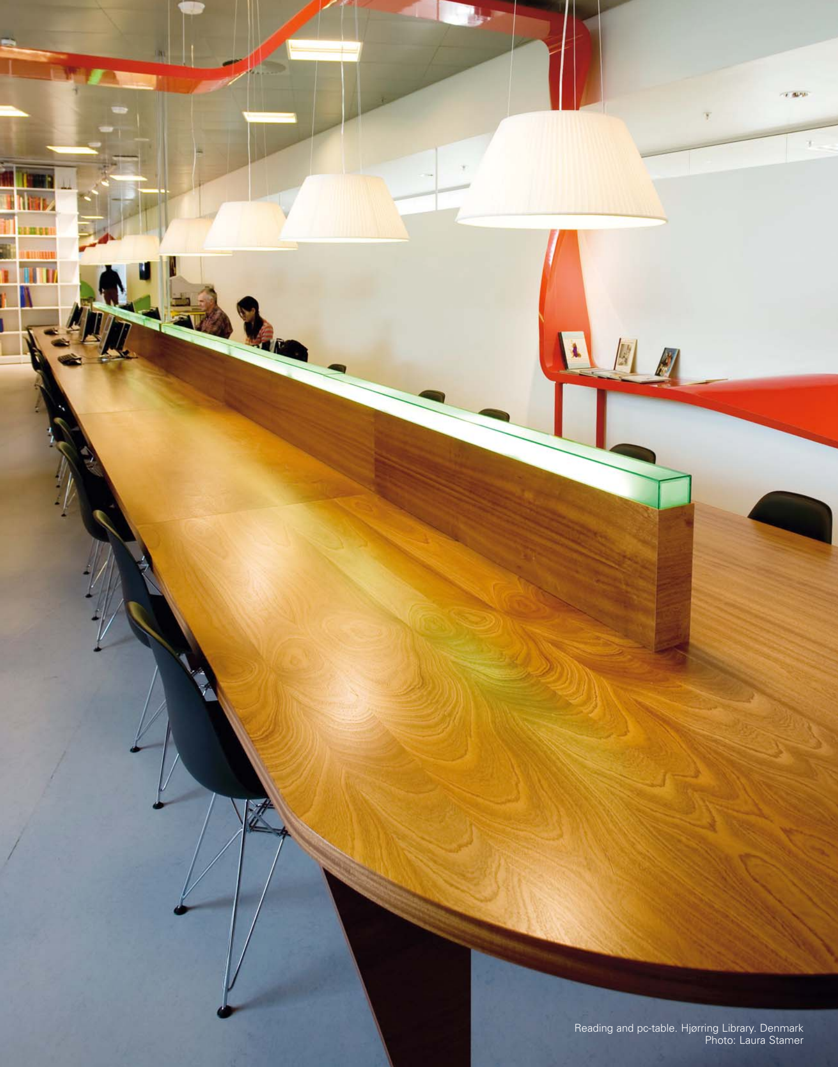
Reading and pc-table. Hjørring Library. Denmark