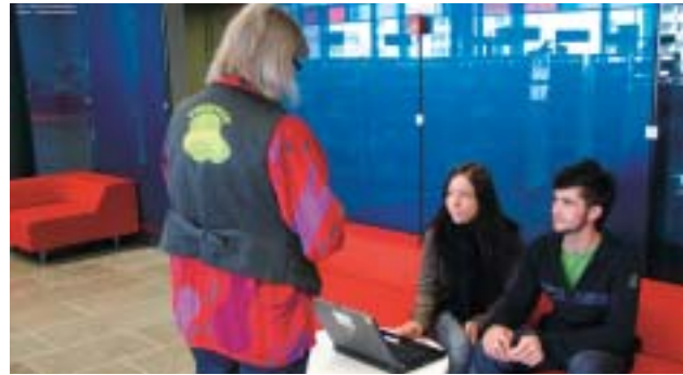
Serving the 'customers'.

A library should have things which are important to it and where its strength lies. At Entresse Library, working with young people and supporting information technology and the use of the Internet are precisely that. These things are a part of the story of Entresse Library. They are important, because we work in an area with many young people and a lot of people who need support in learning the skills of an information society. We have older people who are learning a new life with their first computers. We have recent immigrants to Finland, whom we can provide with an area for stu-