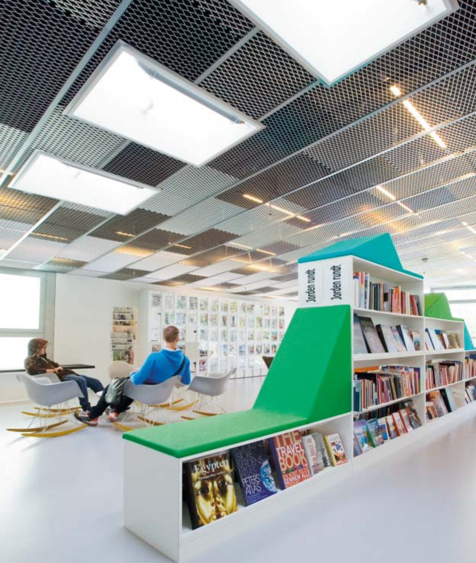
Youth corner at Ordrup Library, Denmark.