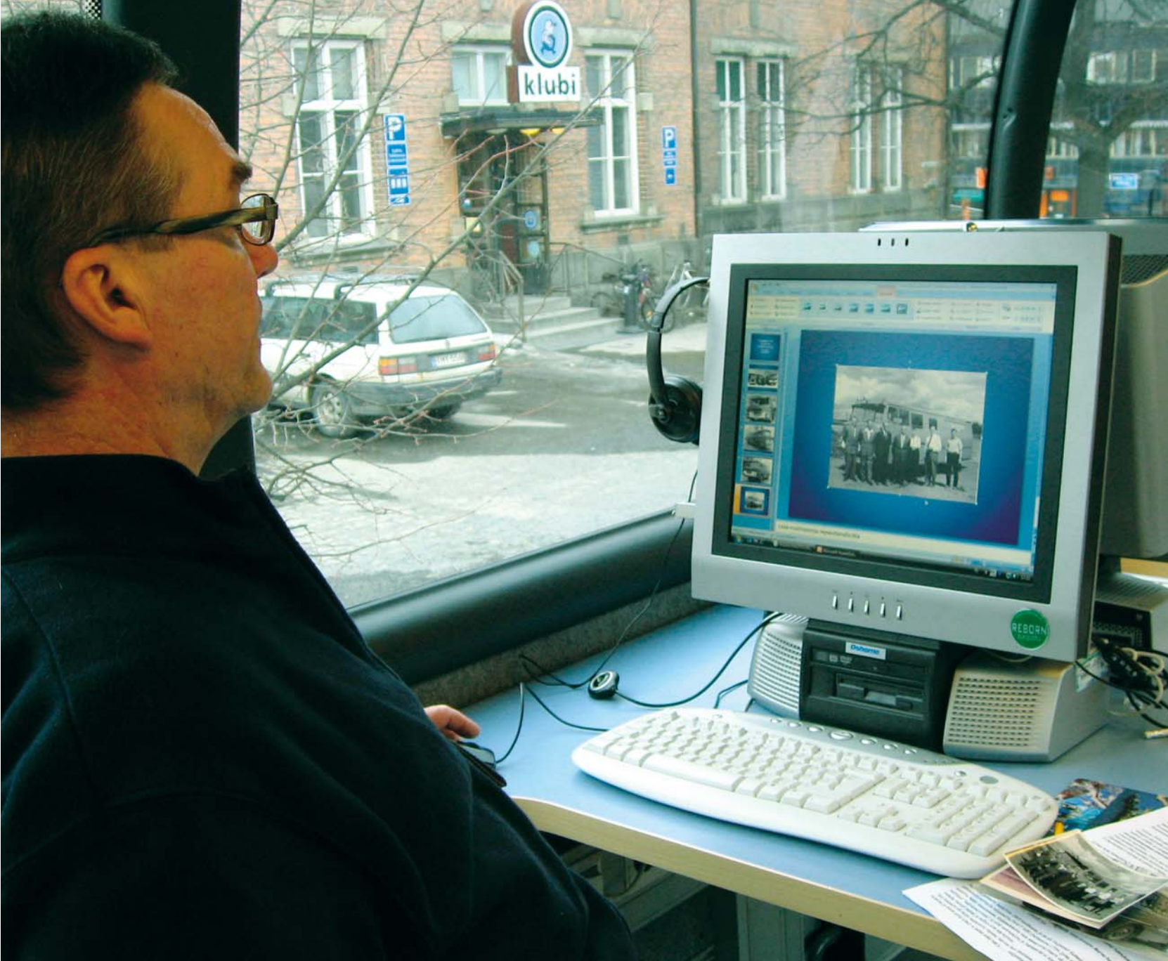
The Internet bookmobile of Tampere City Library, Finland

In times of economic crisis, however, the book loan curve usually swings upward. Libraries are now reporting rising numbers in loans, especially for fiction.