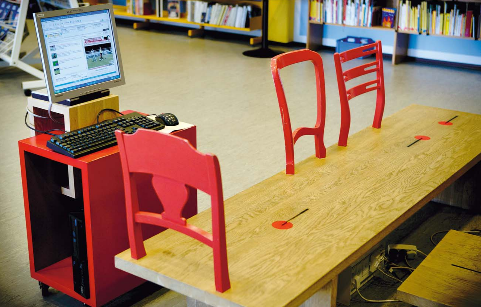
An untraditional digital position in Vejle Library, Denmark

all institutions in the archive, library and museum sectors. The aim of this initiative is to ensure that digital stories and the use of social technology can become a natural and integral part of work in these sectors, so as to raise the whole process of dissemination into an interactive digital world. We believe that the use of new technology and digital tools will help to open up these institutions, introducing new perspectives and voices to the field of cultural heritage. Priority has long been