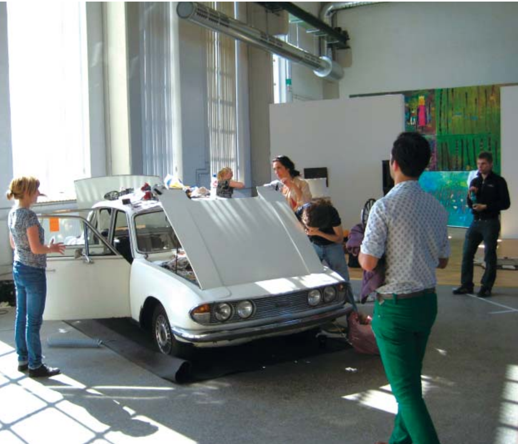
The Garage in Malmö, Sweden.