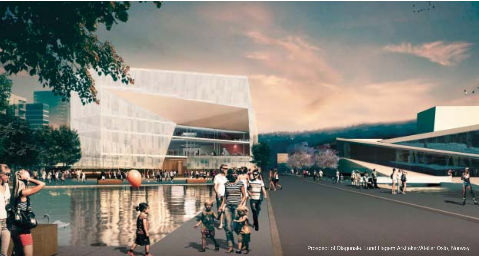
Prospect of Diagonale. Lund Hagem Arkiteker/Atelier Oslo, Norway

A significant phrase in the designing instructions for the competition program was “new library space is structured in accordance with the users’ activities and not dominated by the traditional arrangement of collection.” It is estimated that the new library will receive 2 million visitors per year.