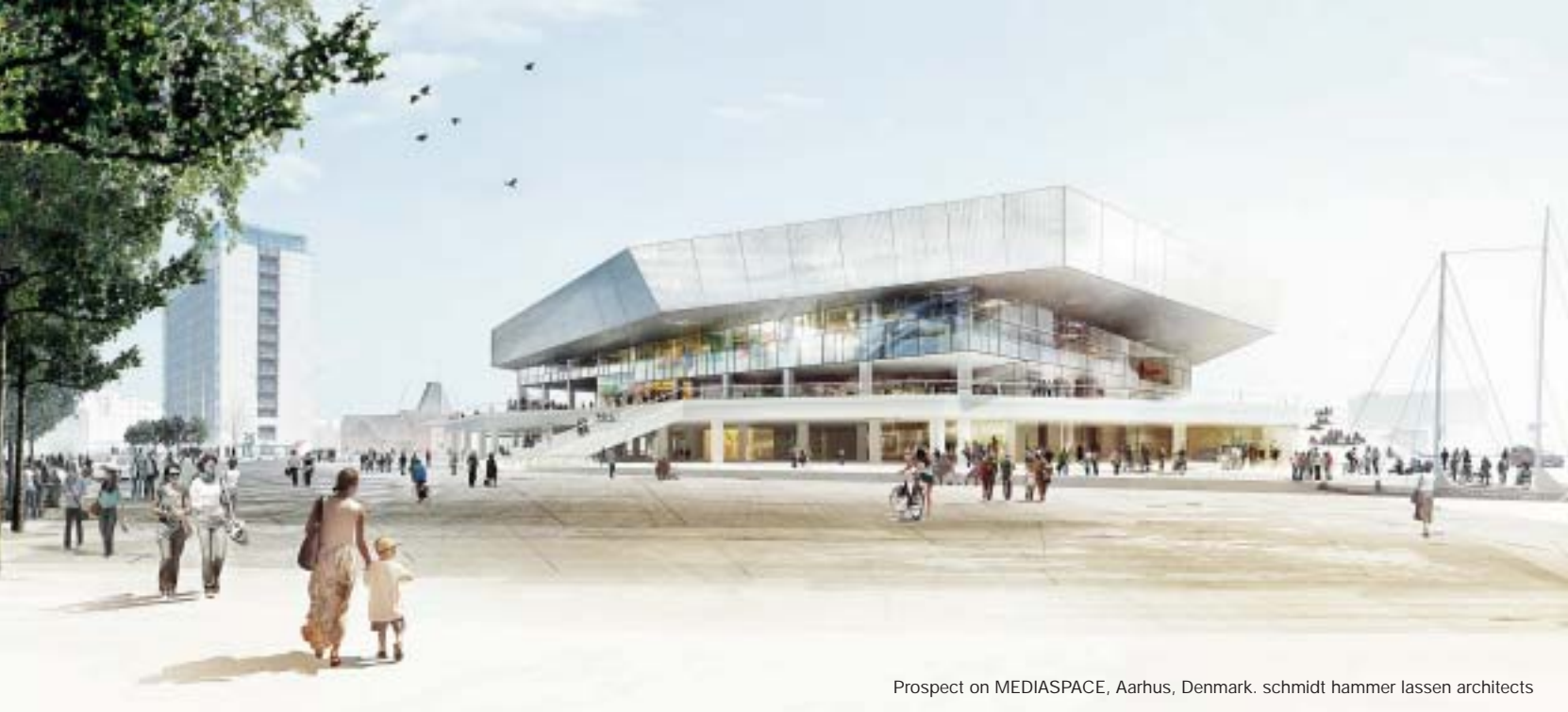
Prospect on MEDIASPACE, Aarhus, Denmark. schmidt hammer lassen architects

lots. The direction and significance of the development is also described in the slogan used by the city: “From viking city to knowledge city”.