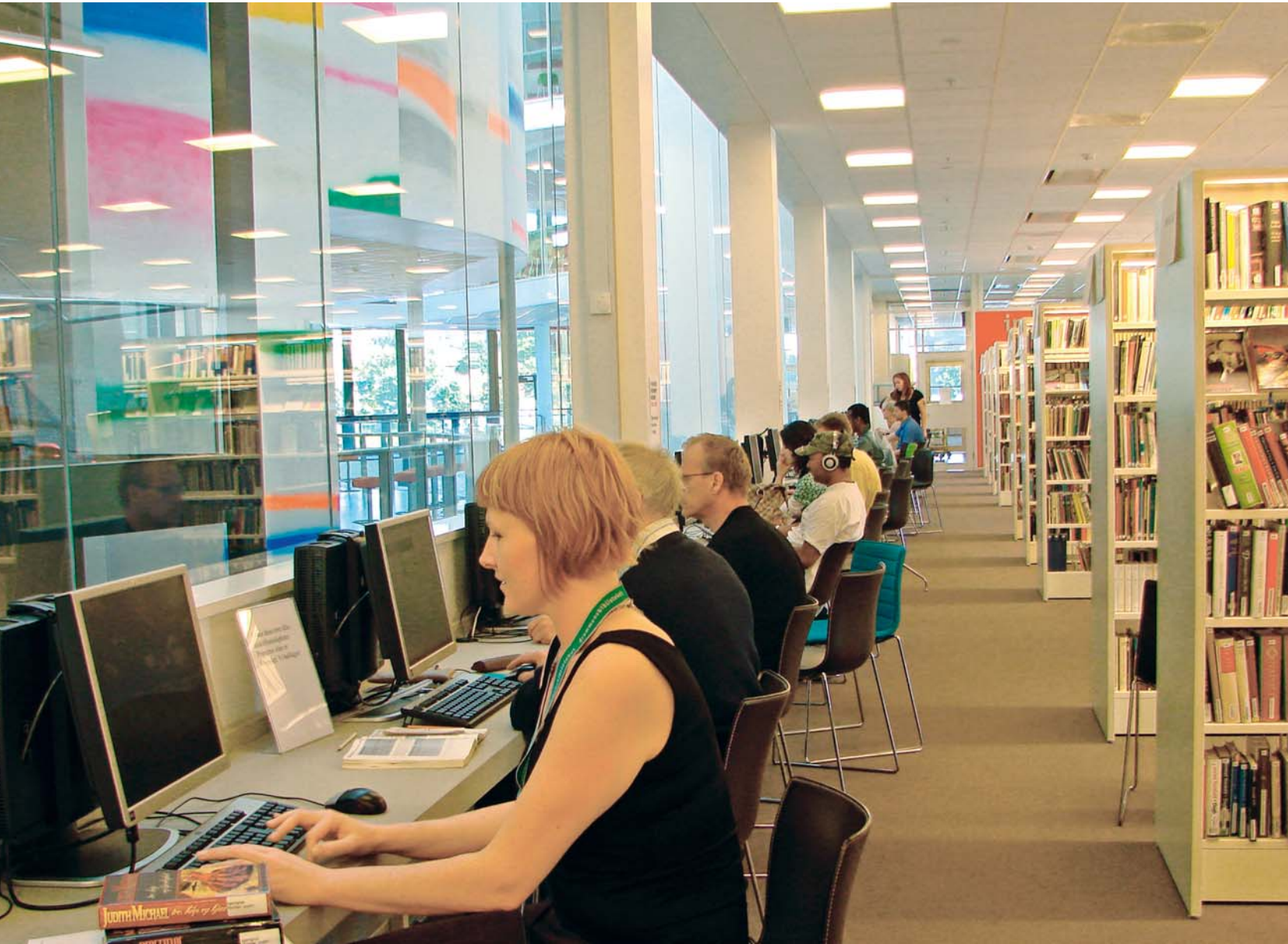
Drammen Library, Norway.