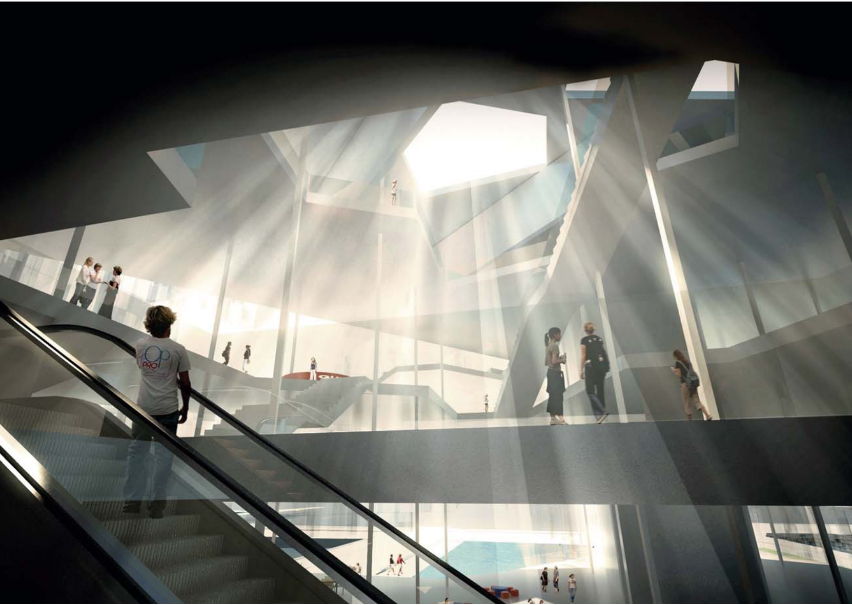
DIAGONALE - the Deichman main library interior. Lund Hagem Arkiteker/Atelier Oslo, Norway