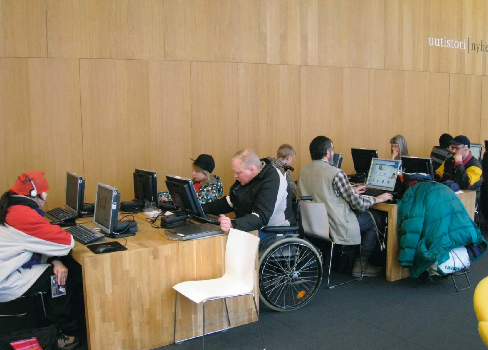
Using net services at Turku Library, Finland.