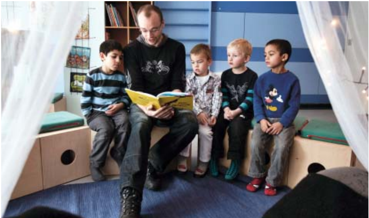
'Dad'-substitute reading for children in Herlev Library, Denmark.