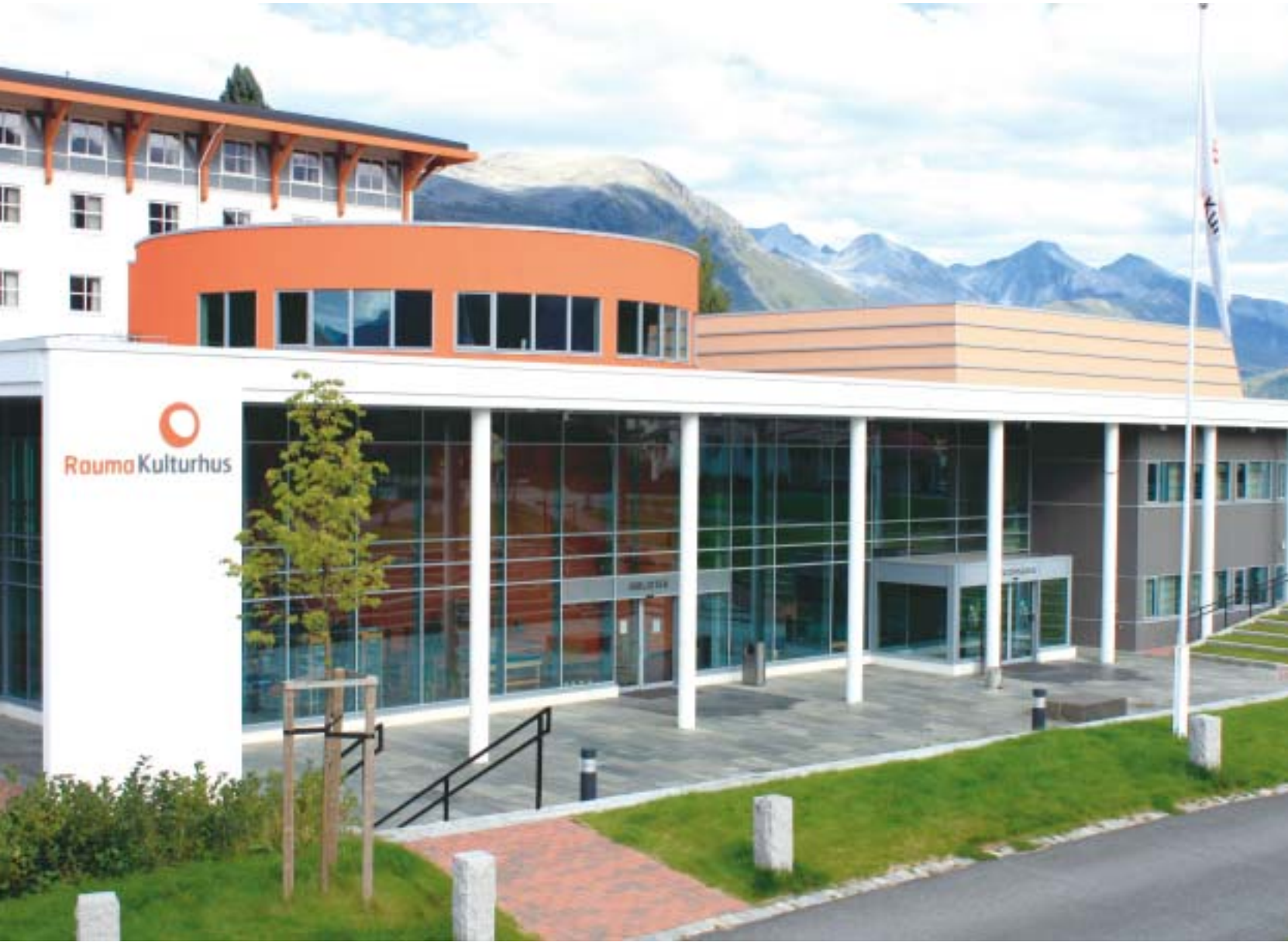
Rauma Culture Centre with library, Norway