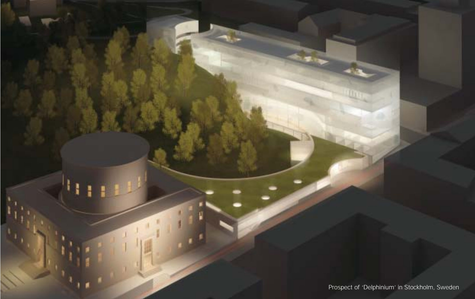
Prospect of 'Delphinium' in Stockholm, Sweden

There were over one thousand entries in the competition and c. 6,000 architects from 120 countries registered in the competition. The competition was one of the biggest architecture competitions of all time.