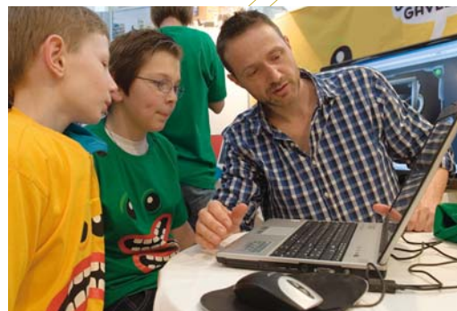
Two boys studying Palles Giftshop, Denmark