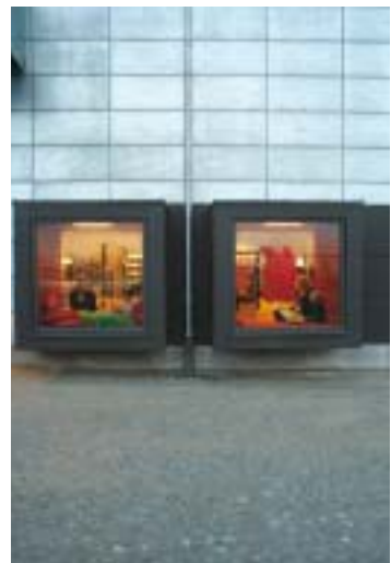
New trends for the children in the physical library. Top: Hjørring Library, Denmark. Bottom: Lomma Library, Sweden